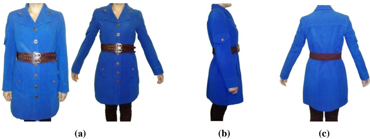
Figure 3. Garment sample (coat): (a) front, (b) right, and (c) back

Usually the finished pattern is made up into a fabric to check the proportions and shape. Garment samples are prototype garments those are made up so that we can check the proportions of the collar (and the whole garment) and the quality of the fitting of the garment. So, figure 3 and figure 4 represent the pictures of transformable garment sample (coat-jacket). Collar's construction was designed with parameters which are inside of the recommended ranges.