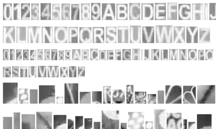
Fig. 4. Example of training sample symbols for machine learning classifier