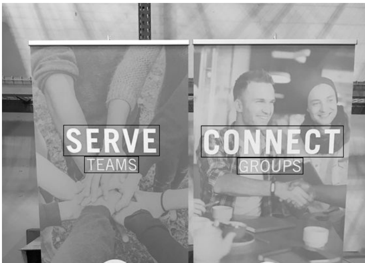
Fig. 1. Segmented words