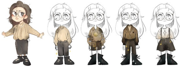
Fig. 4. Costume concept art Developed by authors Diana Onishchuk

The second stage is the formation of the concept itself, that is, a detailed study of the chosen idea. The formation of the concept art of a characteristic character requires a lot of time and effort of the designer, because it is necessary to conduct a study of already existing concepts, perhaps to get acquainted with various historical eras, cultures, photographs, fashion trends, which can creatively inspire and develop the creative imagination of the artist.